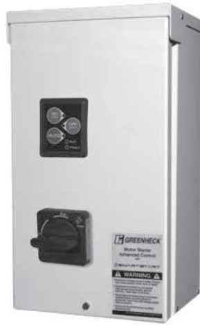
NEMA 3R 16ga. Steel Enclosure