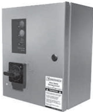
NEMA 4X 304 Stainless Steel Enclosure

Please read and save these instructions for future reference. Read carefully before attempting to assemble, install, operate or maintain the product described. Protect yourself and others by observing all safety information. Failure to comply with instructions could result in personal injury and/or property damage!