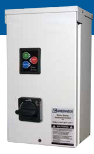
Model MSAC shown with optional disconnect switch